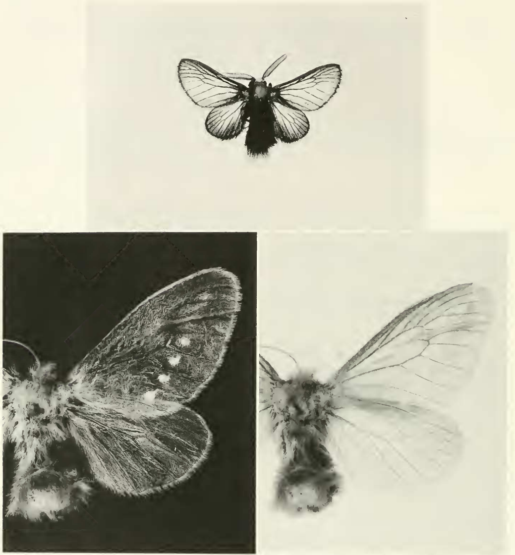
Figs. 1, 2. Potalia bolivari wings: 1 (upper), male wing (USNM) (forewing length 9 mm); 2 (lower), female wing (USNM) (forewing length 19 mm); same specimen illustrated against both black and white backgrounds. Both sexes figured at same scale to show dimorphism.

idocarpus lutescens H. Wendl. (= areca palm or bamboo palm). It is also found on an ornamental fern, Pteridium sp., and Cyperus diffusus Vahl (Cyperaceae), on the Universidad Nacional de Medellín campus. Larvae develop much more slowly on Cyperus than Pteridium . Genty et al. (1978: 382–